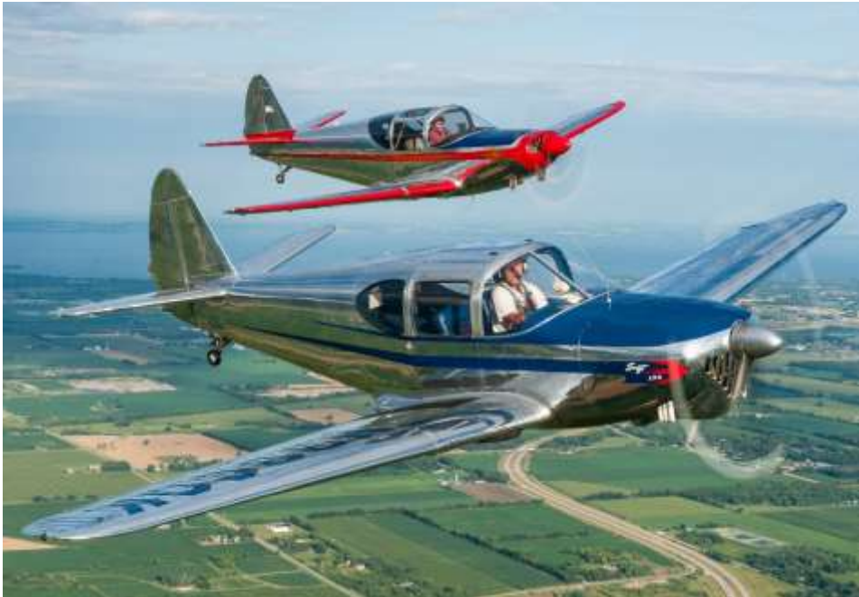
Swift Museum raffle is airborne!