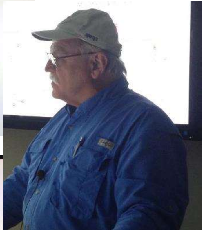
The ALCAN Highway