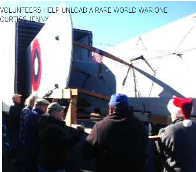
VOLUNTEERS HELP UNLOAD A RARE WORLD WAR ONE CURTISS JENNY

Fuel consumption is near 13 g.p.h. And about half a quart of oil per hour. Ref. JANE'S