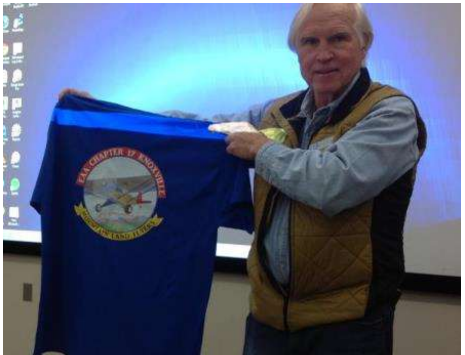
NEW CHAPTER 17 SHIRTS