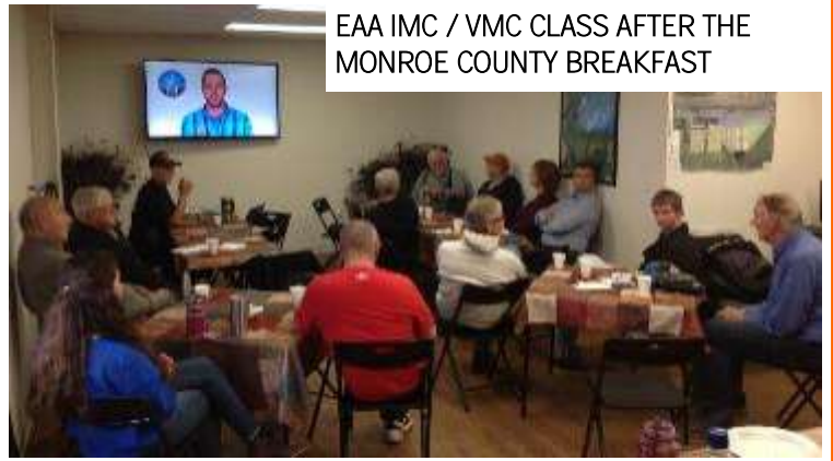
EAA IMC / VMC CLASS AFTER THE MONROE COUNTY BREAKFAST

THERE WILL BE NO REGULAR IMC/VMC MEETING IN JANUARY! The January IMC/VMC Club Class that generally follows the Monroe County Second Saturday Breakfast has been canceled by vote, in deference to the Chapter 17 Banquet. The Monroe County Omelet Breakfast will go on as usual.