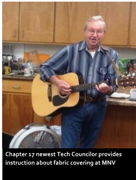
Chapter 17 newest Tech Councilor provides instruction about fabric covering at MNV