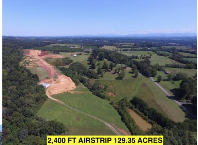
2,400 FT AIRSTRIP 129.35 ACRES

675 New Hwy 68 P.O. Box 147 Sweetwater, TN 37874423-807-7653 hunt4lisa@aol.com http://www.lisahunt.realtor