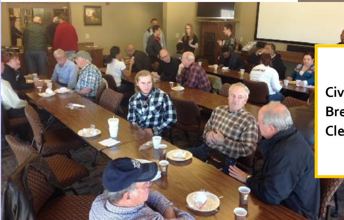
Civil Air Patrol Breakfast in Cleveland