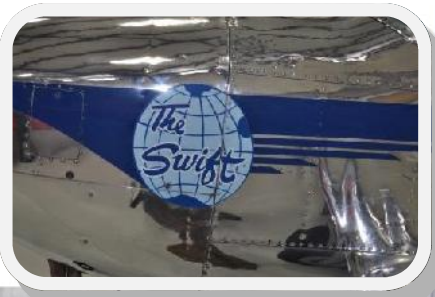
The tube and fabric prototype, Serial # 1 is largely based on the Culver Cadet