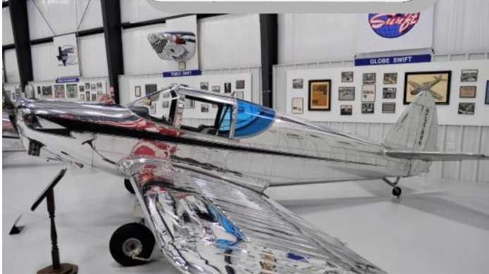
The all metal , Serial # 2, is the TC aircraft