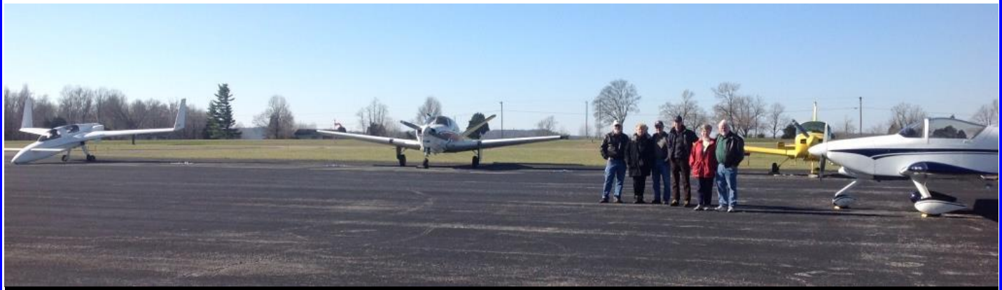
SNAP! SHORT NOTICE AIR POSSIBILITIES EAA 17 members gather at Rough River for their Sunday Buffet.